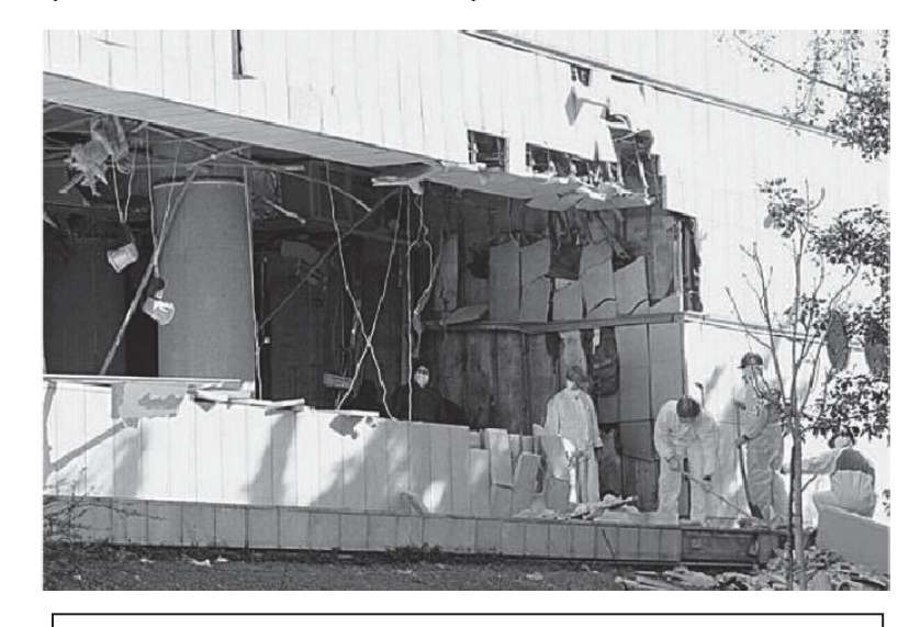
Aftermath of the bombing of the National Bank

prisons, jobs, schools and the army. They are those who explicitly declare every time that 'things used to be different in the past'... The ease that left-wing intellectuals talk about the old 'fair' violence during the period of Resistance [WW II] and the antidictatorship struggle is due to the fact that only they have the privilege of democracy to have their voices heard. The reason is simple. They are the same people that renounce all kinds of revolutionary violence today, while they have the profile of a fake 'militant' past."