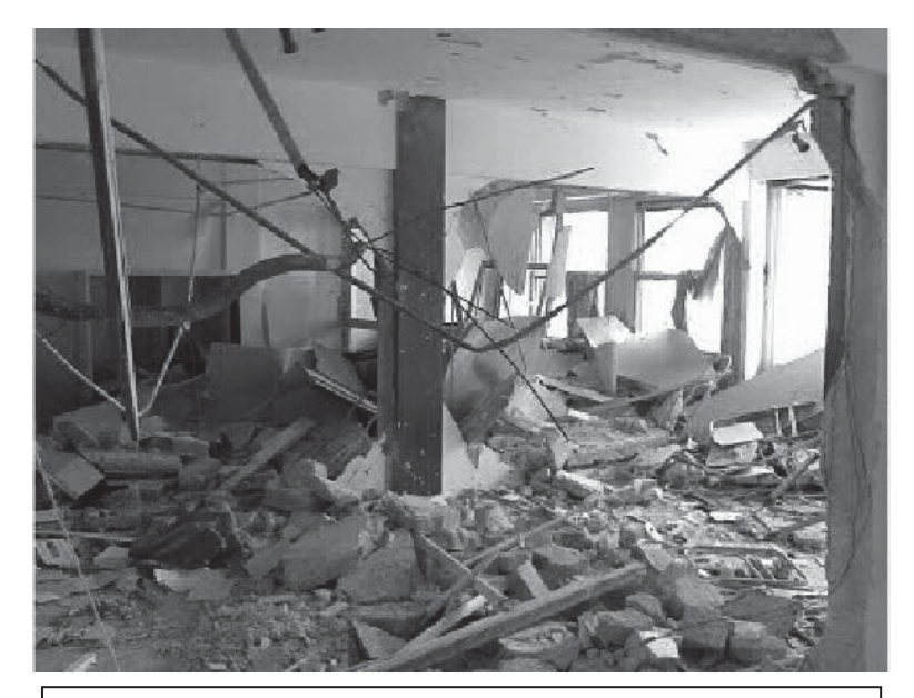
The gutted interior of the Golden Dawn offices

Early January 2010: The CCF bombs the courtyard of the Greek Parliament . Damage is caused to the famous statue of the 'Unknown Soldier' and the windows of the Parliament.