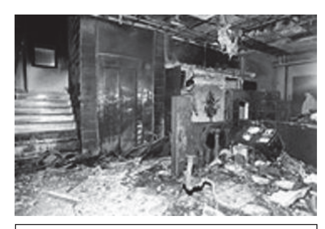
Destruction from the 'festival of fire'.

Panopticon is utilized in every expression of the older and the new forms of surveillance and the industry of fear is set for good. Cameras, cops, juries, municipal cops and security patrols safeguard this new complex net of captivity."