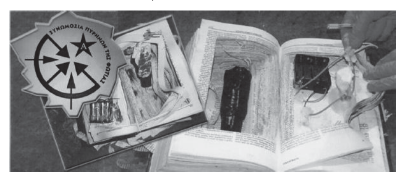
Defused parcel-bomb sent as part of campaign

Mid May 2010: Two powerful explosions in Athens (one outside Korydallos prison) and Thessaloniki (the Law Court, which is flushed out after a warning before the bomb shatters almost the entire building). The CCF claims responsibility for the two attacks with a communiqué explaining the choice of targets, and also with a text examining the burning of the Marfin bank in central Athens during a demonstration in which three bank workers were killed, calling for a non-vanguardist "revolutionary militarism" and the careful organisation of any attack undertaken, to avoid unintended casualties.