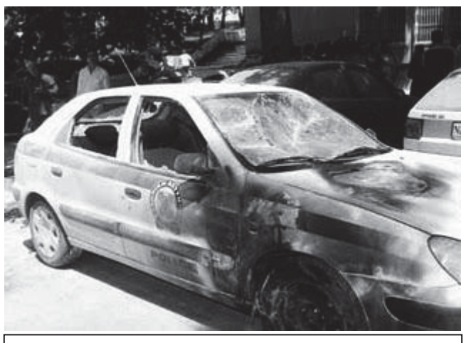
Photo from the 13 September attack on Dimokratias square police station.

13 September, 2008: 'Asymmetric Threat' attack police cruisers with Molotov cocktails and gas canister bombs at the Dimokratias square police station, torching vehicles and machinery of the Police and causing damage to the police station. "The days pass so indifferently. They seem