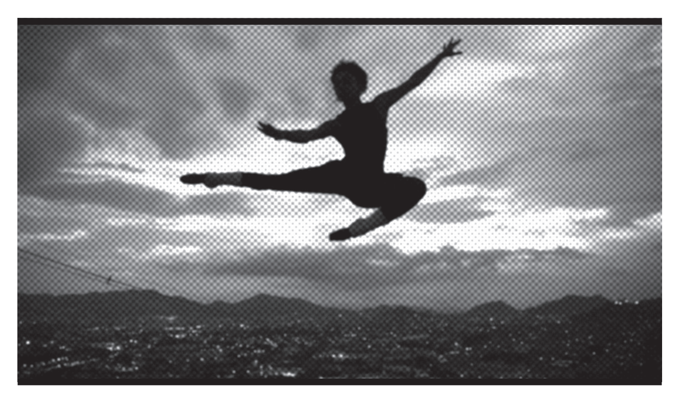
Don't vote them in, kick them out!